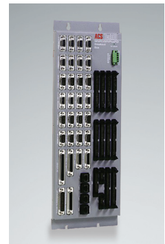
SPiiPlus Breakout Box for easy integration and cables connection