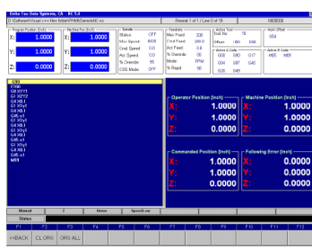
PMAC-NC Pro2 - a Windows-based customizable GUI for PC based CNC control