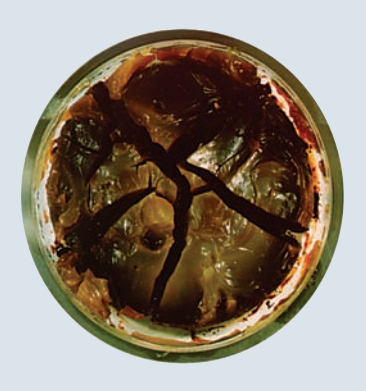
In an oven at 232 °C (448 °F) for 40 hours, the hydrocarbon lubricant had 40% weight loss.