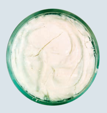
In an oven at 232 °C (448 °F) for 40 hours, Krytox® lubricant had 0% weight loss.