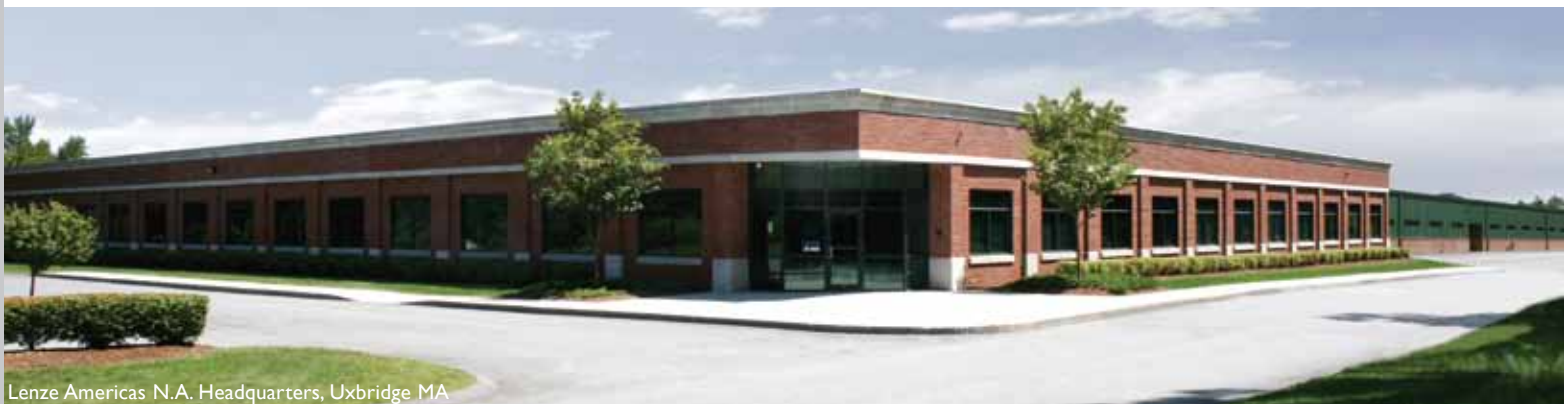
Lenze Americas N.A. Headquarters, Uxbridge MA