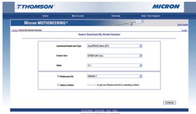
"Select Gearheads by Model Number" is quick and easy when you are familiar with Micron Gearheads and know what you're looking for.