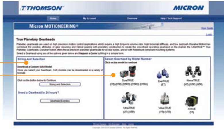
Choose the selection mode that works best for you - "Select by Model Number" or "Sizing and Selection."