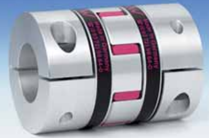
Standard version with clamping hubs