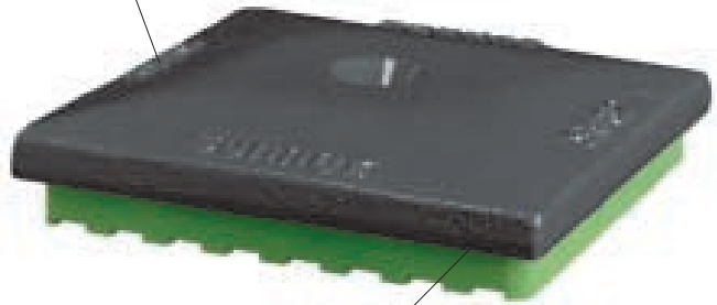
Integrated anti-vibration pad made from impervious nitrile rubber