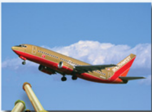
737 Wing Flap Ball Screws