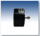
Brush DC Miniature Motor