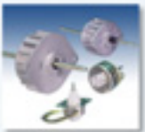
Digital Linear Actuator